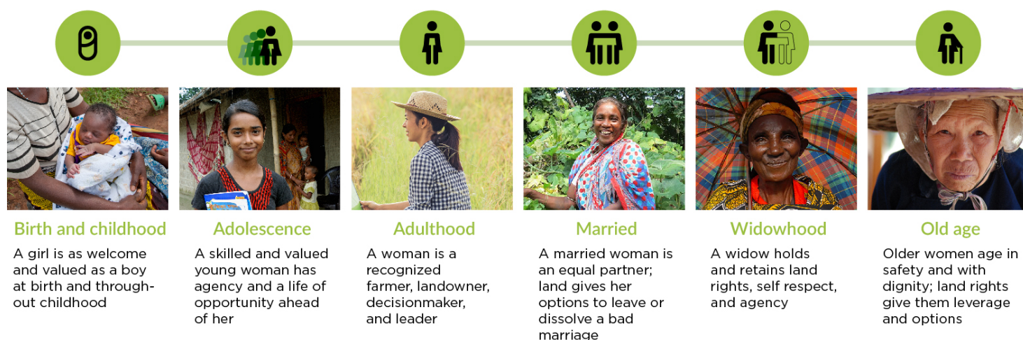
Chart 2: Envisioning a life cycle of equality and opportunity

We hope that this lifecycle perspective on women's rights to land helps to inspire more holistic interventions to address inequity in land rights and supports advocacy for gender equality and women's empowerment more broadly.